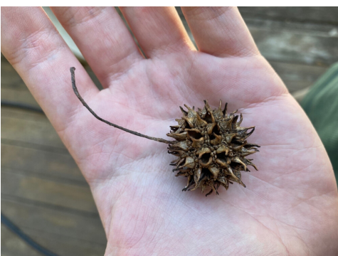
Close-up of Sweetgum ball

The next step is to glue the sweetgum balls together. You can do this at a slight angle on each one to make it curved. Lining the spikes into the holes can help lock them together. Make sure to save one sweetgum ball to the side.