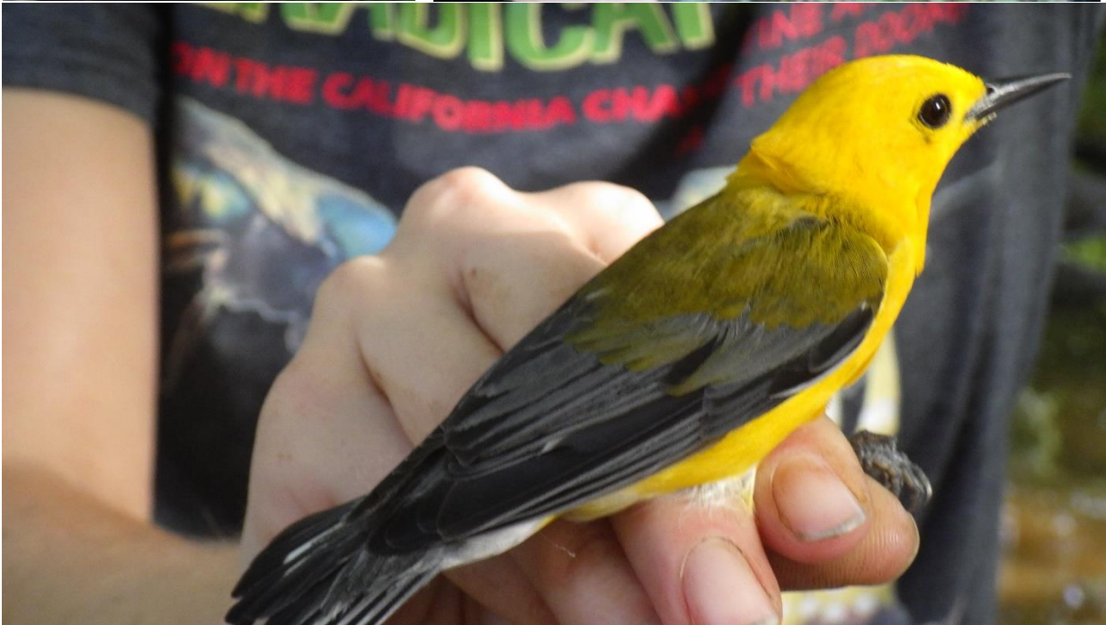
Pictured above Kentucky Warbler, Northern Waterthrush and Prothonotary Warbler.