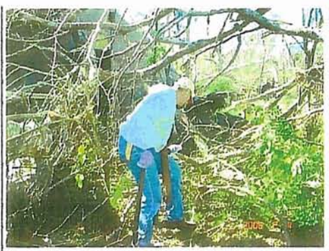
Post-Katrina -Louisiana Hiking Club clears fallen trees blocking path leading to WWII Ammunition Magazines

Although one of our regions' last stands of bottomland hardwoods provided a significant wind protection to the surrounding residential and commercial properties, previously established trails became impassable and the grouping of ten WWII Ammunition Magazines, inaccessible.