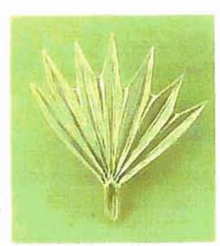
14K Gold Stud Pin