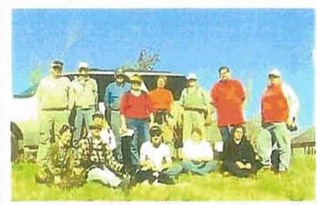
Louisiana Hiking Club and University of Louisiana Lafayette Students in Naturalist and Docent Practices

mark trails. The Louisiana Hiking Club and area volunteers worked with the students to clear trees and debris as the trails were marked. The ULL students became so invested in the Woodlands effort, they unanimously voted to forego a trip planned to an established park, to return to Woodlands for a second weekend in March. Although not the typical trail maintenance activity of the Louisiana Hiking Club members, they also chose to return in March and help clear more trails.