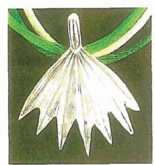
Sterling Silver Pendant