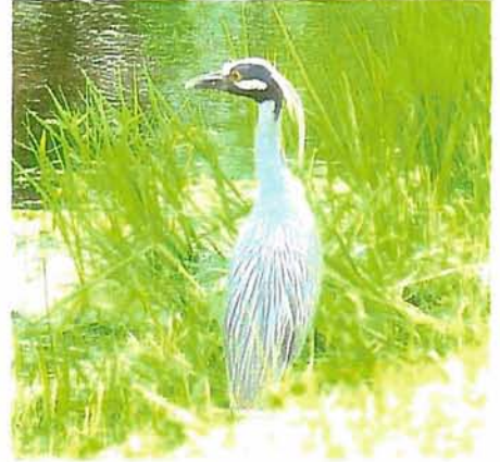
Yellow-crowned Night Heron

We are grateful to the "gumbo" of private citizens, corporations, interest groups and governmental entities that have made re-establishing trails possible.