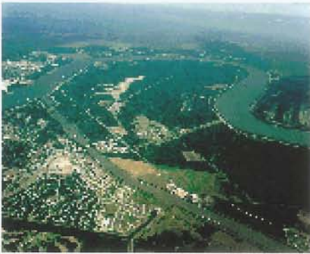
English Turn/Lower Coast/Belle Chasse Peninsula

needed who are willing to be trained to collect the oral histories. The Library of Congress is funding LSU to train our volunteers. Woodlands Trail's Oral History Project will allow this portion of our region's military history to be preserved in perpetuity, not only locally but at the LSU Library and Library of Congress.