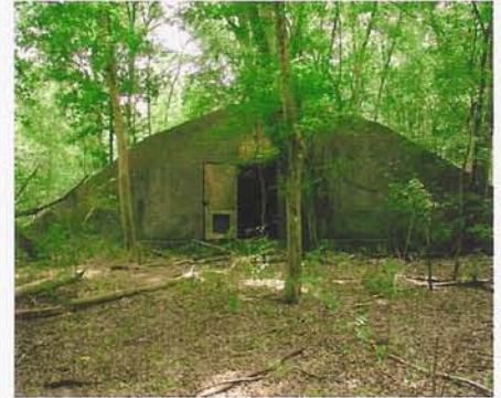
WWII Naval Ammunition Magazine Belle Chasse, Louisiana

associated with the Naval Ammunition Depot property.